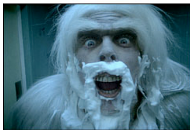
Extreme Grooming. The Yeti prepares for the SOS snowboard competition in these moments from the Snowboard Outreach Society commercial.