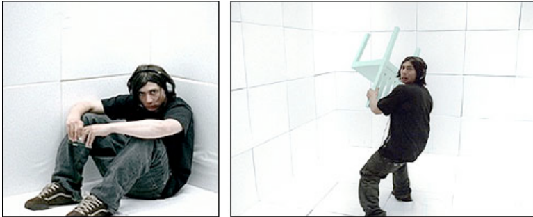
In a Padded Cell, Olympic silver medal snowboarder Danny Kass appears in the Vans "American Nightmare" TV commercial created by Windowseat.